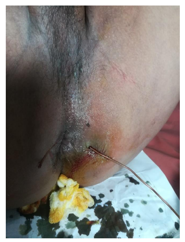
Fig. 1. On first day of consultation: probing done at 3-3 0' clock