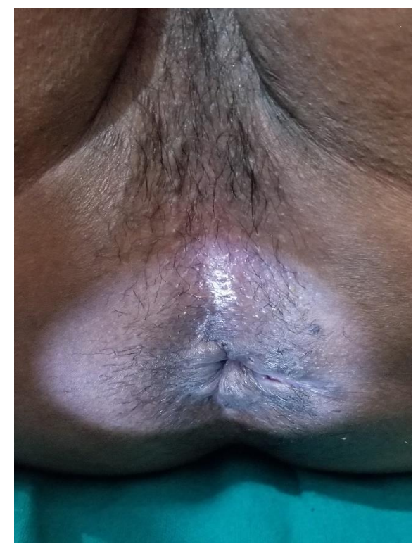
Fig. 4. Healed wound after 21 days

The initial length of the track was 4 cm. which got cut through in 21 days. Kshara sutra was changed every week that time it causes burning pain in ano only for one day and subsite after taken sitz bath. After cut through ofthe track patient was followed up for 3 months weekly. Unit cutting length of track was 1.33 cm per week. No sign and symptoms of recurrence were observed.