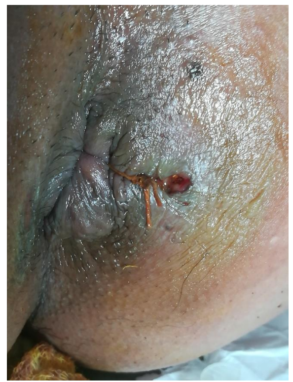
Fig. 2. Kshara sootra ligation at 3-3 o'clock

After due consent of patients, he was planned for Apamrga Kshar Sutra management. After application of xylocaine jelly 2% probing was done. [Fig. 1] then Apamrga Kshar Sutra was ligated into the fistulous track. [Fig. 2] Patient was advised to maintain local hygiene by sitz bath od luke warm water and also take care of proper bowel habits. Wound was healthy during changing of tread. [Fig. 3] Kshar Sutra was changed weekly by Rail-Road technique weekly till complete cutting of the fistulous track. [Fig. 4]