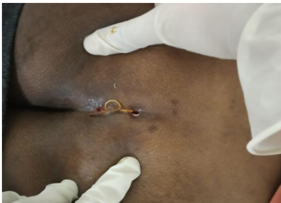
Figure-3: Ksharasutra application in PNS tract