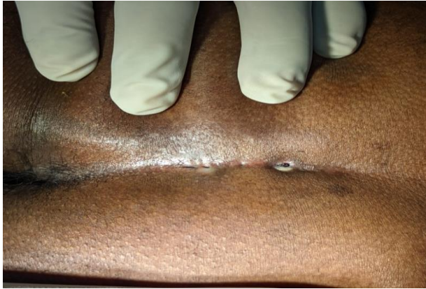
Figure-1: Clinical presentation of Pilonidal Sinus involving Sacrococcygeal region