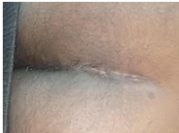
Figure-4: Completely healed PNS tract