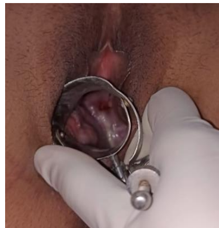
Figure-2: Red cervix with white creamy discharge