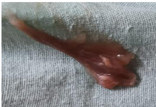
Figure-1: Clot in menstrual blood