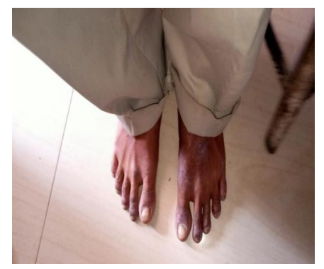
Figure 2- [b]: Before Treatment