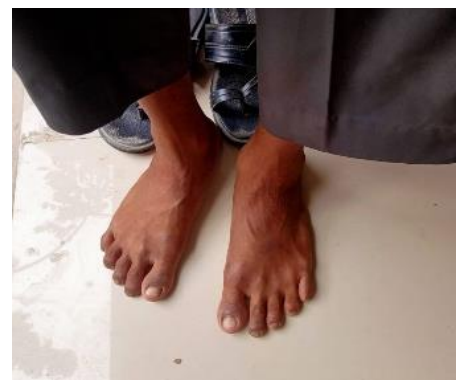
Figure 3- [b]: After Treatment

The patient's consent was taken regarding the publication of clinical information in research