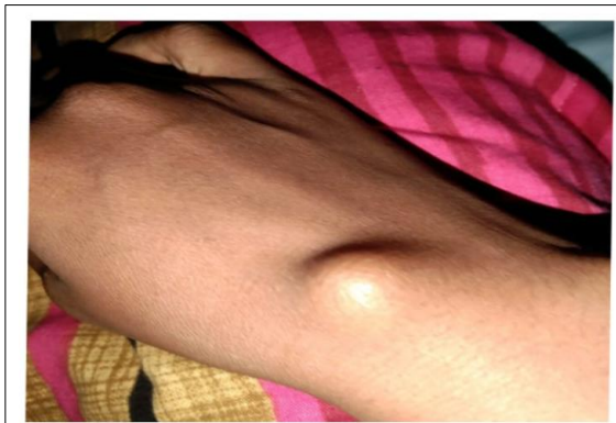
Fig-1: Wrist Ganglion On 01/09/2021