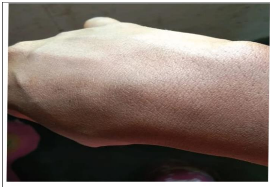
Fig-2: Wrist Ganglion On 29/12/2021