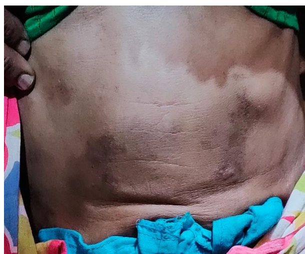
Figure-2: Establishment of normal skin mucosa after successful treatment.