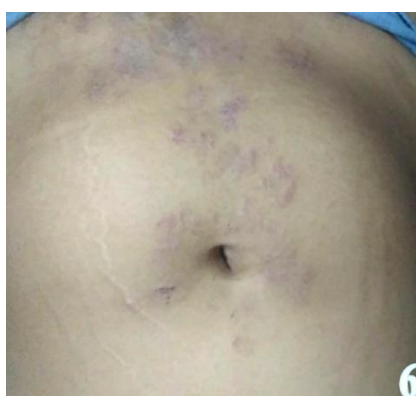
Figure 5&6: Appearance of the lesion during the treatment in case-2