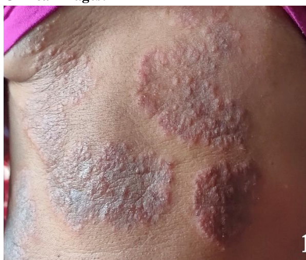
Figure-1: Circular lesion in the anterior aspect of abdomen and chest in case-1