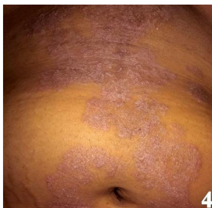
Figure- 3&4 Lesion before the treatment in case-2