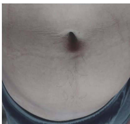
Figure 7&8: Disappearance of the patches at the end of treatment in case-2