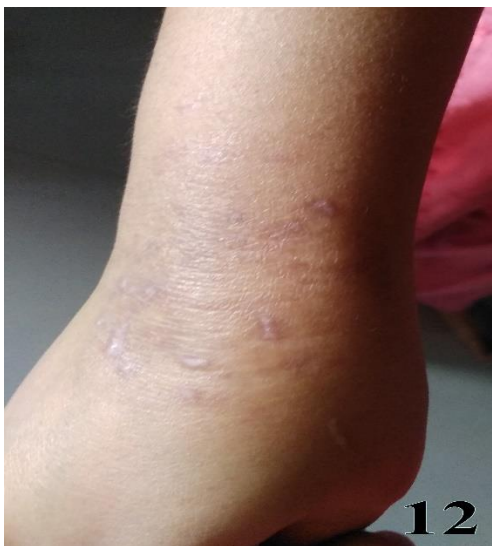
Figure-11 &12: Change in appearance of circular lesion at the wrist before and after treatment in case-4