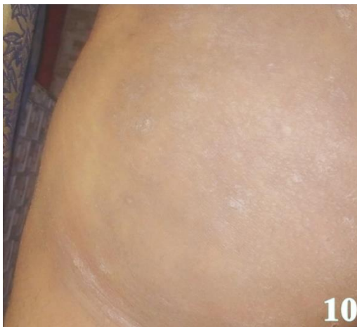
Figure 9 & 10: Appearance of the lesion before and after the treatment in case -3